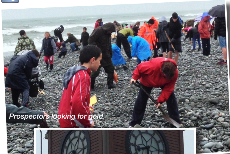
Prospectors looking for gold