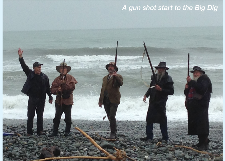
A gun shot start to the Big Dig

A massive thank you to everyone who has been involved in making these celebrations such a success.