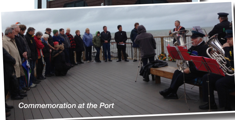
Commemoration at the Port