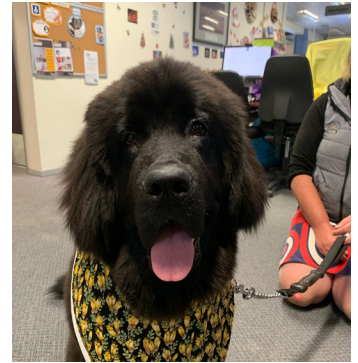
Moolu settling in at the Library