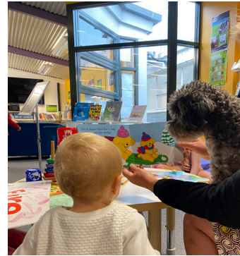
Waldo listening to reading