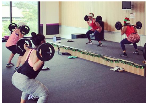
Christmas time BodyPump class

You can check out the complete timetable on our website, www.greydc.govt.nz/westlandrec