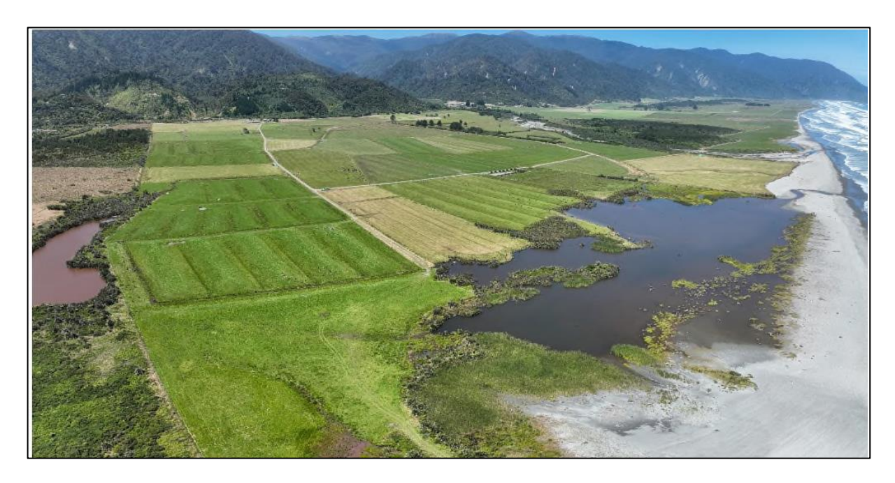
Figure 17: Collins Creek Lagoon in January 2024 showing raupō flaxland in the foreground and partially drowned rushes and sedges on the coastal edge of the lagoon