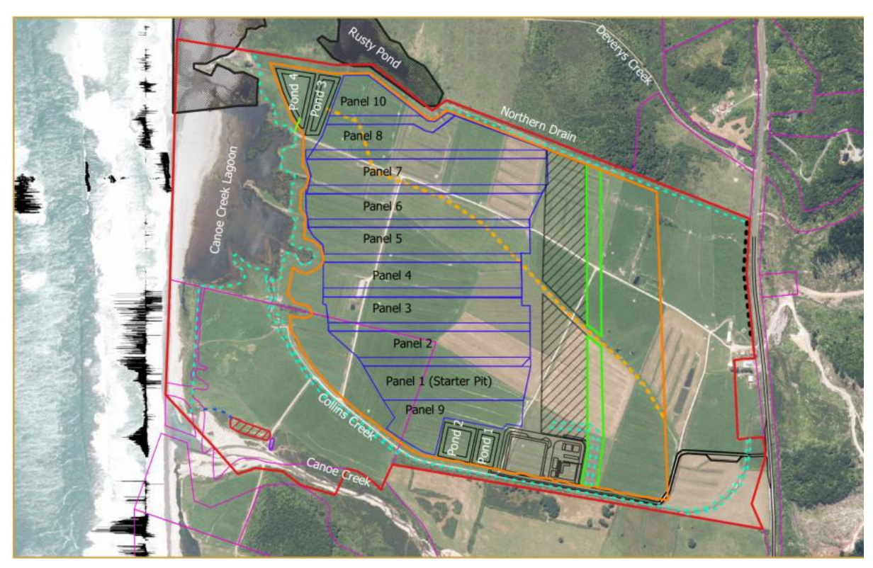
Figure 1: General site layout