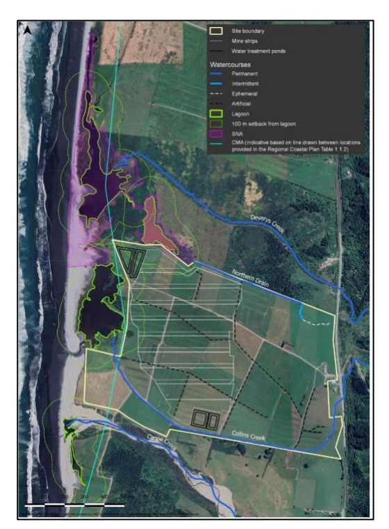
Figure 16 – Location of 100 m setbacks from the wetlands Application Site, Barrytown

[150] Dr Bramley's Figure 16 is also helpful, and it is included below.